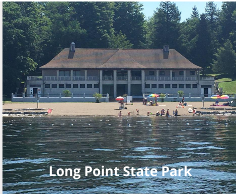
Long Point State Park

4859 Rt. 430 Bemus Point, NY 14712 716.386.3165 parks.ny.gov/parks/167/details.aspx