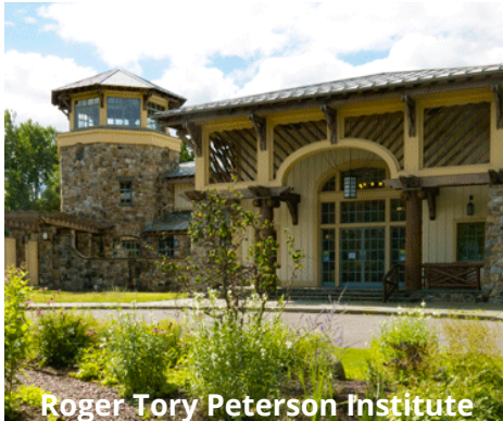
Roger Tory Peterson Institute

Explore Roger Tory Peterson Institute's 30 acres of woodland preserve. These are the very same woods that once inspired a young Peterson to fall in love with the natural world. Take a tour of the 23,000 sq. foot architectural gem erected to preserve and display the most comprehensive collection of Peterson's artwork, photographs, fills, manuscripts and related archival material. The Institute also regularly exhibits the work of other famed artists.