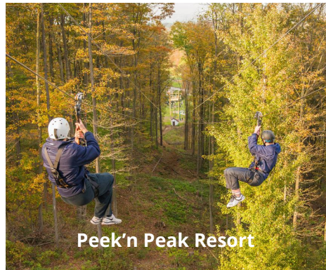
Peek'n Peak Resort

11 Rock Hill Rd. Panama, NY 14767 716.782.2845 www.panamarocks.com