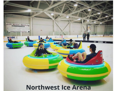
Northwest Ice Arena

20 West Third St. Suite 9 Jamestown, NY 14701 716.217.9039 www.escaperoomsjamestown.com