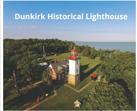
Dunkirk Historical Lighthouse

Tour the Dunkirk Historical Lighthouse and Veterans Park Museum. The lighthouse was established on Point Gratiot in 1827. It was refitted with a 3rd-order Fresnel lens in 1857; the very same lens is used in the current tower, which was first lit in 1875. Climb the 61-foot tower to see the lens as well as an incredible view of Lake Erie. The Veterans Museum consists of 10 rooms of displays including each branch of the military services, maritime history and depiction on the life of Lighthouse Keepers.