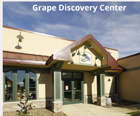
Grape Discovery Center

1 Lighthouse Point Dr. Dunkirk, NY 14048 716-366-5050 www.dunkirkighthouse.com