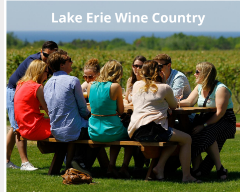
Lake Erie Wine Country

5 Melrose Park Lily Dale, NY 14752 716-595-8721 www.lilydale.org