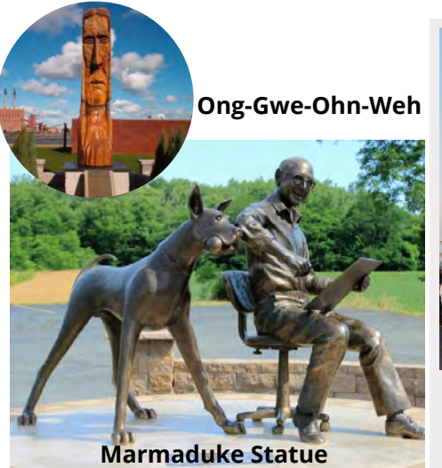
Stop for Some Photo Opps

Stop along Rt. 5 in Dunkirk at the Whispering Giant wooden sculpture of Native American representation created by Peter Toth.