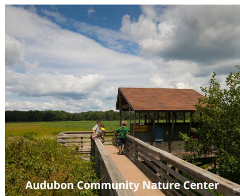
Audubon Community Nature Center

116 East Third St. Jamestown, NY 14701 716.484.7070 www.reglenna.com