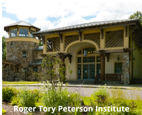
Roger Tory Peterson Institute

Born and raised in Jamestown, New York, Roger Tory Peterson became the premier artist-naturalist of the 20th century. Tour the Institute, a 23,000 sq. foot architectural gem erected to preserve and display the most comprehensive collection of Peterson's artwork, photographs, fills, manuscripts, and related archival material. The Institute also regularly exhibits the work of other famed artists.