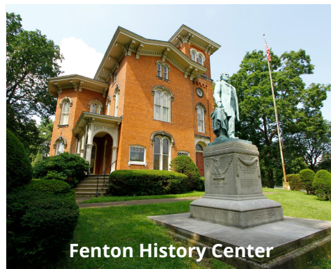
Fenton History Center

305 E. Fourth St. Jamestown, NY 14701 716.483.6646 www.roberthjackson.org