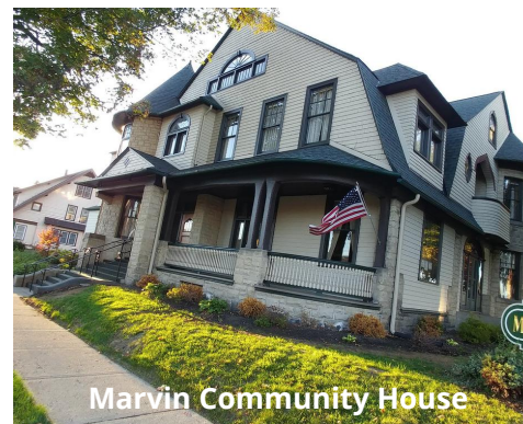
Marvin Community House

2 W. Third St. Jamestown, NY 14701 716.484.0800 www.lucy-desi.com