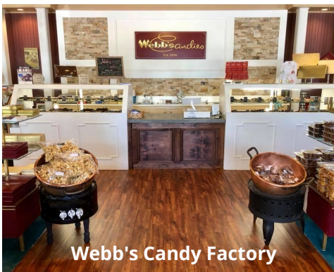
Webb's Candy Factory

78 Water St. Mayville, NY 14757 716.269.2355 www.269belle.com