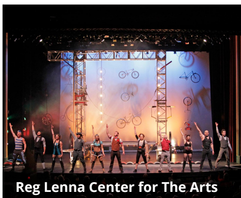
Reg Lenna Center for The Arts

311 Curtis St. Jamestown, NY 14701 716.665.2473 www.rtpi.org