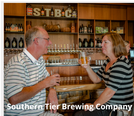
Southern Tier Brewing Company

LaQuinta Inn & Suites Rooms 61 200 W. Third St, Jamestown, NY 14701 716.484.8400 www.lq.com