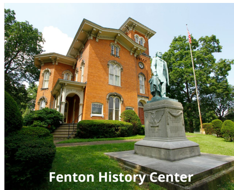
Fenton History Center

305 E. Fourth St. Jamestown, NY 14701 716.483.6646 www.roberthjackson.org