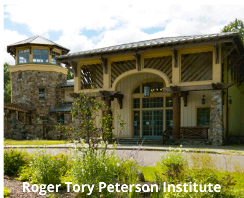
Roger Tory Peterson Institute

Born and raised in Jamestown, New York, Roger Tory Peterson became the premier artist-naturalist of the 20th century. Tour the Institute, a 23,000 sq. foot architectural gem erected to preserve and display the most comprehensive collection of Peterson's artwork, photographs, films, manuscripts, and related archival material. The Institute also regularly exhibits the work of other famed artists.