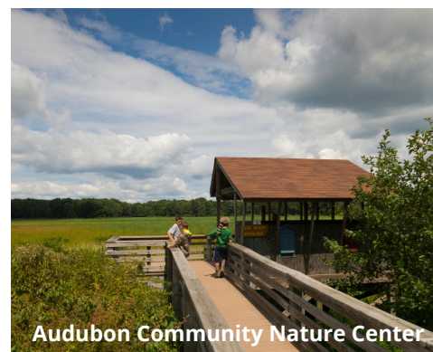
Audubon Community Nature Center

116 East Third St. Jamestown, NY 14701 Box Office: 716.484.7070 Main: 716.664.2465 www.reglenna.com