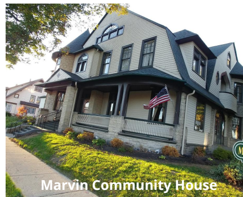
Marvin Community House

2 W. Third St. Jamestown, NY 14701 716.484.0800 www.lucy-desi.com